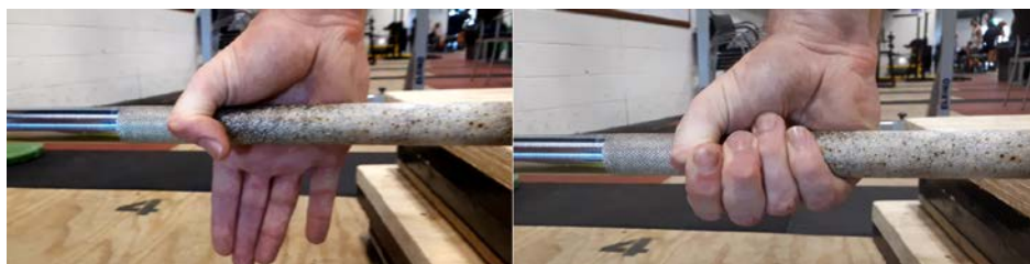
Figure 1. Hook-grip

Competitive weightlifters routinely utilize the hook-grip (HG) (Figure 1) when performing pulling actions (Tsuruda, 1989). Anecdotally, the HG prevents the barbell from rotating in the lifter's hand, thus enabling a secure grip (Tsuruda, 1989). Athletes and coaches report that a minimal amount of muscular effort is required to maintain a secure hold of the bar with a HG. By requiring less muscular tension in the finger flexors (Tsuruda, 1989), the arms remain passive, leading to a greater force transfer from the prime movers of the legs and back, facilitating greater force and power outputs (Tsuruda, 1989). This increased power output may benefit long-term athletic development (Channell & Barfield, 2008; Cormie et al., 2010; Hori et al., 2008). Therefore, the primary purpose of this study was to compare the kinetics and kinematics of the power clean with and without the HG. It was hypothesized that the HG would increase 1RM, and enable greater levels of force, velocity and power to be generated compared to a standard closed-grip (CG). It was also hypothesized that the HG would enable an optimized bar-path when compared to the CG condition.