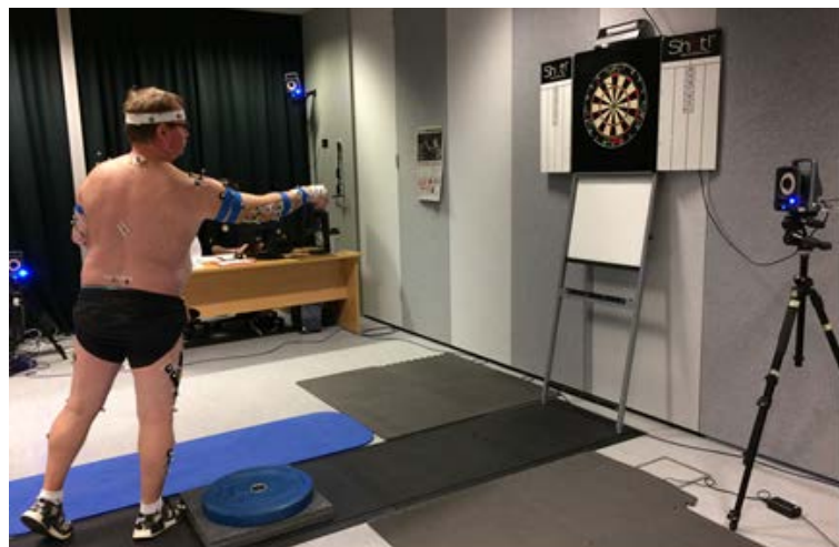
Figure 1: Laboratory set-up for recording darts throwing.

METHODS: The male darts player (50 years, 176.2 cm, 84.7 kg) attended a data collection session at the SPRINZ motion capture laboratory. The laboratory was outfitted to meet competition regulations, including the dart board, dart board mount height (172.7 cm ground to the