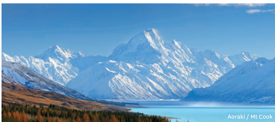
Aoraki / Mt Cook