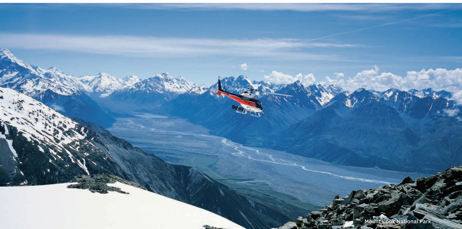
Mount Cook National Park

This itinerary is just a sample of the kind of incentive experiences you can have in New Zealand. For a customised itinerary find an expert incentive operator at businesssevents.newzealand.com